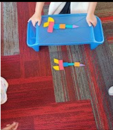
Co-operative maths in action.