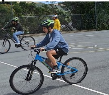
Preparing for the Kākā camp.