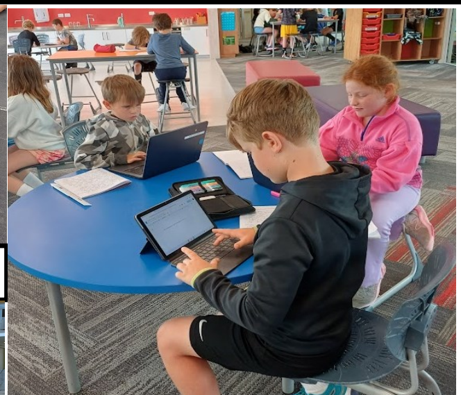
Publishing our writing.