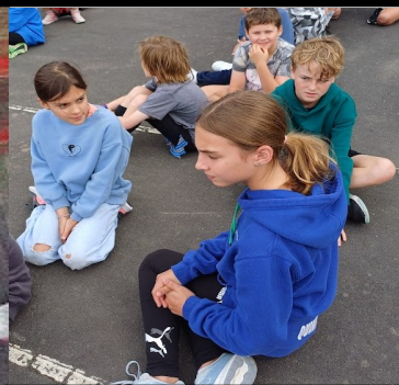
Fire drill practice.